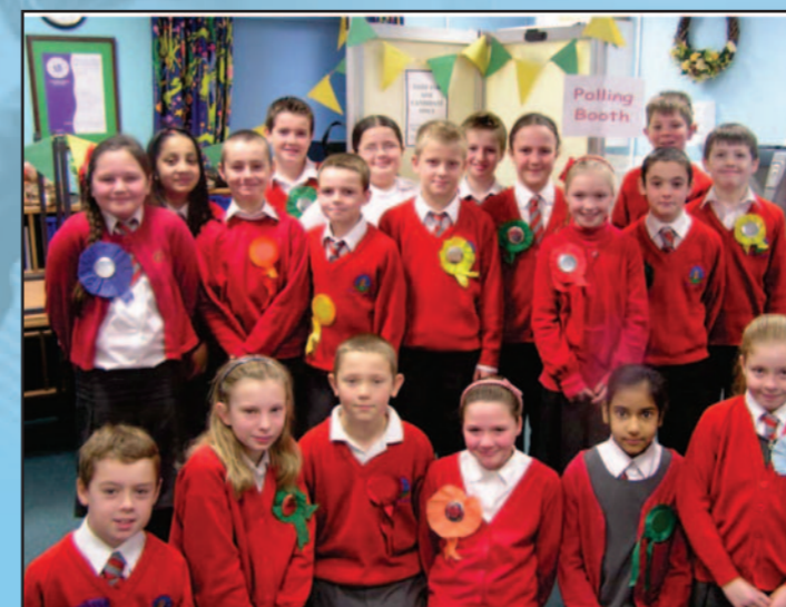
Year 6 Candidates on Polling Day for School Council Elections

"Judged as outstanding in all five areas on two consecutive occasions November 2005 & September 2008"